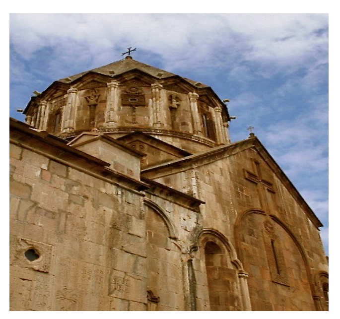
Gandzasar's donor portraits, depicting the Armenian prince Hasan-Jalal (2015)

Hasan Jalal Dawla's wish to commission the Gandzasar Monastery, the construction of which began in 1216 and lasted until 1238. The donor portrait on the exterior of the church, on the dome, depicts Prince Hasan Jalal sitting cross-legged with a model of the church — a device meant to project power at the Seljuk court. Despite adopting an Arabic-influenced name as was fashionable at the time, Prince Hasan Jalal Dawla (Grand Prince