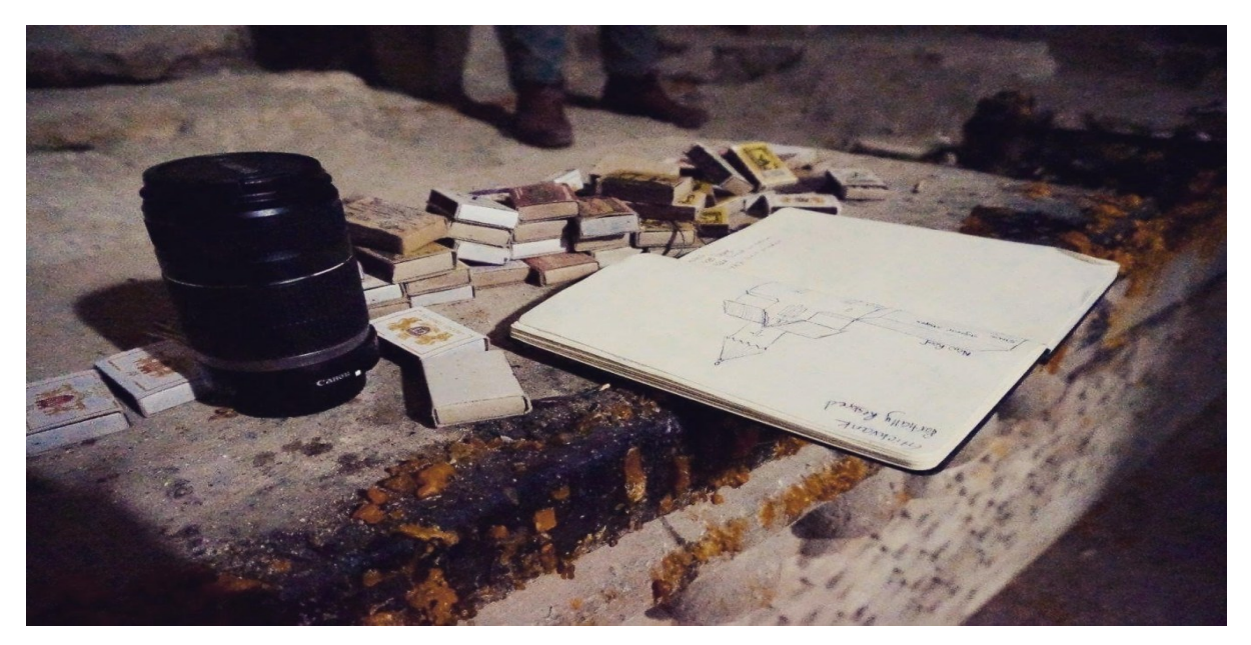
Gtichavank's altar (2015), covered in matchboxes and thick layers of candle wax, indicated that local Armenian Christians continued to visit the cathedral for devotional purposes despite that it had not been maintained during the Soviet period.

Looking back now, these thoughts were a fantastical defense-mechanism. In reality, I was keenly aware that exactly 100 years ago, in 1920, Azerbaijanis (or rather, Caucasian Tatars as they were then still commonly called at the time) with the help of their ethnic allies the Ottoman Turks — fresh from their genocide of 1.5 million Armenians — killed every last Armenian in Shushi, burned 7,000 Armenian homes and businesses, and destroyed the city's Armenian churches. At the time, Artsakh's population was over 90% Armenian, but territorial control of the region was in flux. Due to the Caucasian Tatars' claims on the Armenian homeland, including Artsakh, Zangezur, and Nakhichevan, the League of Nations rejected in December 1920 the recently formed Azerbaijan Democratic Republic's request for statehood, finding that it was impossible to determine the exact limits of territory over which it exercised authority.