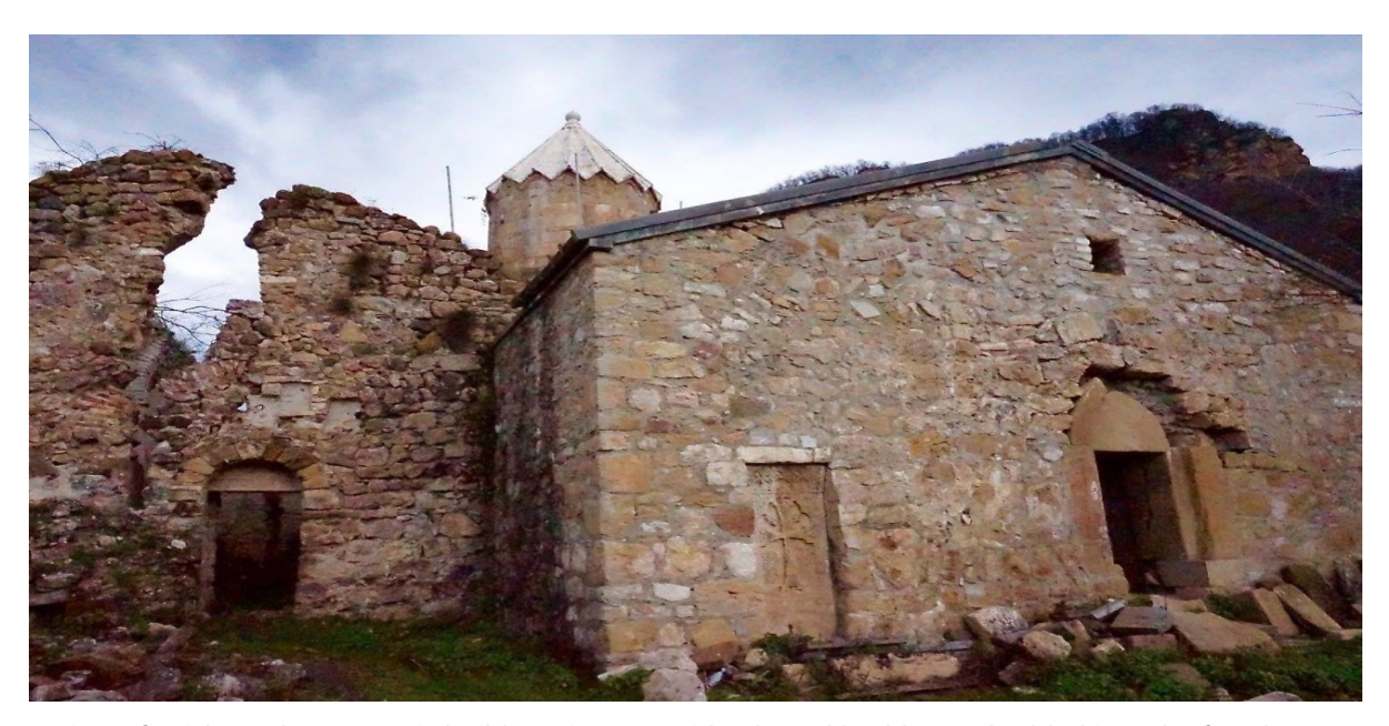
A view of Gtichavank's monastic buildings in 2015 with a large khachkar embedded into the facade

There are over 4,000 Armenian cultural sites in Nagorno-Karabakh, including 370 churches. Now that most of this cultural heritage is in Azerbaijan's de facto control, even with the presence of Russian peacekeepers in certain regions, there is little hope that Azerbaijan will not destroy them. Most experts predict that Azerbaijan's cultural genocide will occur slowly over many years, if not decades, starting with the more recent Armenian churches, dating to the 17th to 19th centuries (as with Ghazanchetsots and Kanach Zham in Shushi) before moving on to the older, lesser known sites (such as Okhte Drni in Hadrut and Yeghishe Arakyal near Madagiz , which contains the tomb of the king of the Caucasian Albanians, " Vachagan the Pious "), and finally to the crown jewels of Armenian cultural heritage (such as Dadivank).