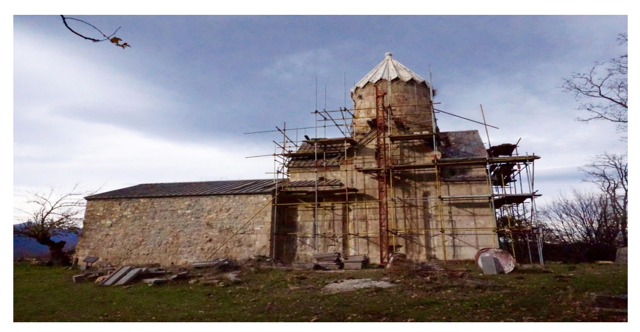
Gtichavank in Hadrut was undergoing extensive restoration before Azerbaijan's recent military aggression (2015); this cathedral is now under Azerbaijani control.

(2) Founding Inscriptions and Donor Portraits: Two other distinctive elements of Armenian cultural heritage are inscriptions explaining the church's founding and accompanying portraits of the church's donors. Donor portraits are particularly unique to Armenian churches in the region, the most notable of which were created in the ninth and 10th centuries by the Bagratuni dynasty, and which typically depict a model of the church in the hands of its donor. As such, inscriptions and donor portraits are the most problematic elements for Azerbaijan's claims that Armenian churches are Caucasian Albanian, because the inscriptions are engraved using the Armenian alphabet and the donor portraits document and depict the Armenian nobles that commissioned the cathedrals and gave land for the monastic sites. Azerbaijani revisionism posits, again with no basis, that these inscriptions were added by Armenians centuries later to hide the Caucasian Albanian provenance of these cathedrals. Accordingly, if given the opportunity, many people fear that Azerbaijan will erase Nagorno-Karabakh's cathedrals of their Armenian inscriptions. Already, the Azerbaijani Ministry of Defense released a video from Dadivank , and in the footage Dadivank's inscriptions (which are prevalent on both the interior and exterior walls of the cathedral) are tellingly absent.