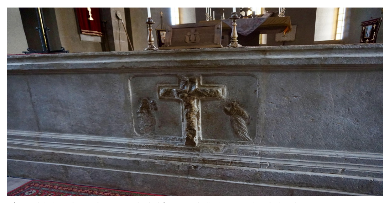
After reclaiming Ghazanchetsots Cathedral from Azerbaijani-occupation during the 1990s Nagorno-Karabakh War, the Armenians chose not to repair certain elements of the cathedral's destruction to serve as a reminder for future generations — including this example whereby Jesus's face and most of his body have been hammered off, presumably by Azerbaijani iconoclasts (2015).

Azerbaijani Soviet Socialist Republic ("SSR"). Soon after, apparently under pressure from Turkey and to placate the Azerbaijan SSR, Joseph Stalin carved out Artsakh from its ancestral home in Armenia and plopped it within the borders of the recently created and oil-rich Azerbaijan SSR. As a half-hearted consolation to the Armenians and perhaps out of recognition that Artsakh had maintained a multiethnic but Armenian majority population for over two-thousand years, the territory became an autonomous, largely self-administered oblast (the Nagorno Karabakh Autonomous Oblast), with Shushi as its administrative center.