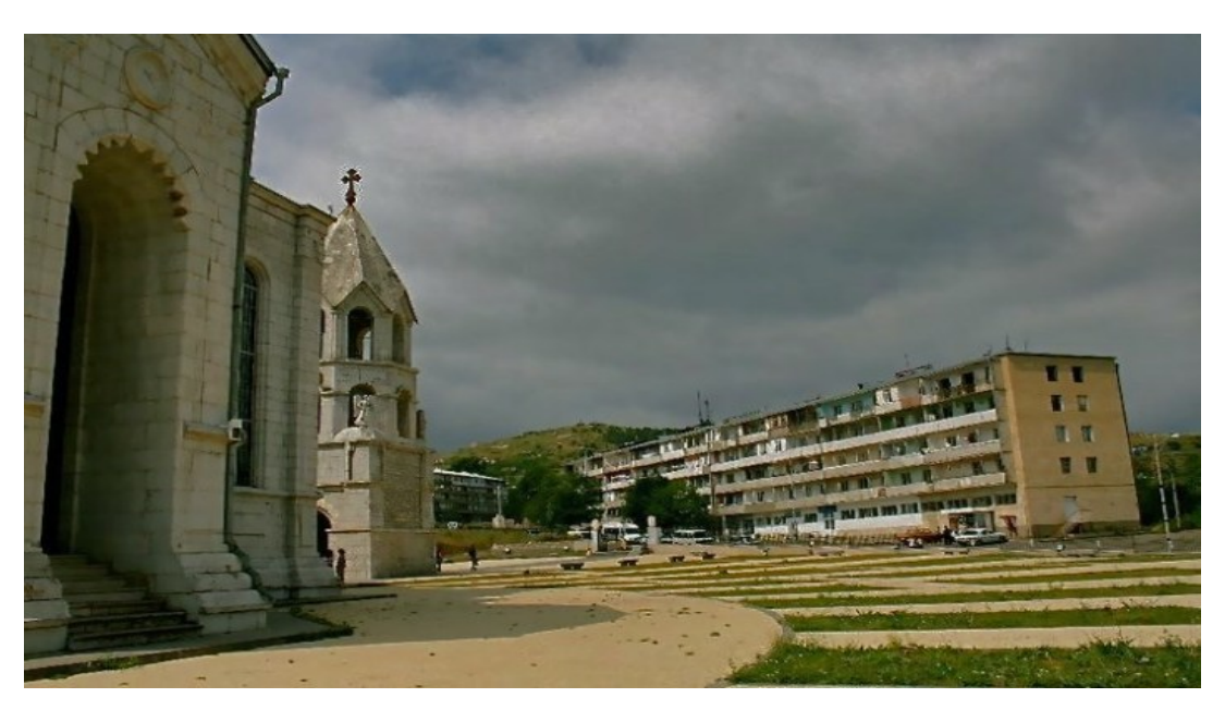
The view from Ghazanchetsots Cathedral (2010)

2020, I watched a Russian-Azerbaijani journalist on a Russian news program, Evening with Vladimir Soloviev, posture that the attack, if it did happen, was justified because Armenian soldiers were using Ghazanchetsots Cathedral for prayer and Azerbaijan must snuff out these Armenian "terrorists" in whatever "toilet" they can be found. While soldiers praying in a church does not justify converting a religious or cultural site into a military objective under the relevant international laws, it is a telling portrayal of how today's despotic Azerbaijan teaches Azerbaijanis to view Armenians and Armenian cultural and religious heritage.