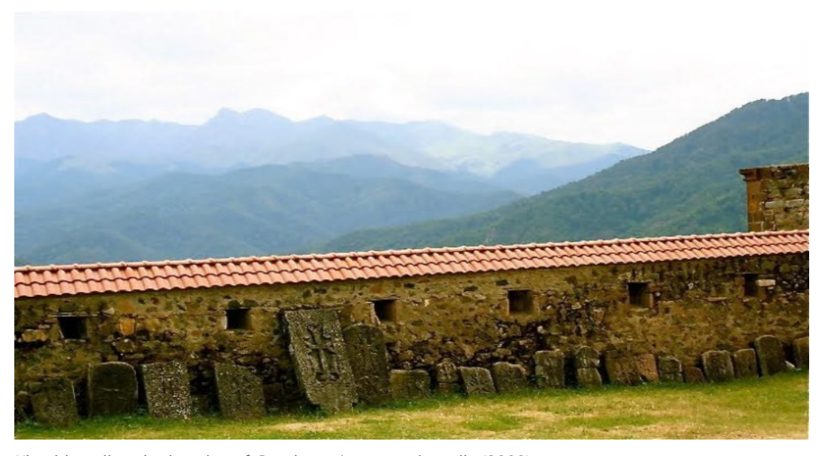
Khachkars line the interior of Gandzasar's monastic walls (2009)

Nagorno-Karabakh's Christian religious sites unquestionably refer to a unique Armenian visual tradition. Nevertheless, trying to disentangle what Christian heritage is exclusively Armenian versus Caucasian Albanian is beside the point: Living Armenians use and venerate these sites and living Armenians are now excluded from these sites. Therefore, the calls to save Armenian cultural heritage are not pleas to preserve an extinct indigenous group's millennia-old monuments for future tourist attractions; they are an urgent demand to stop an ongoing cultural genocide, which has seen hundreds of Armenian sites erased from present-day Turkey and the South Caucasus. For now, however, Nagorno-Karabakh's sites still stand after hundreds of years of conquest and are a living witness to the region's long Christian heritage. Nagorno-Karabakh's cultural landscape thus poses a formidable challenge to modern, competing territorial claims. Any ethnic group laying claim to Nagorno-Karabakh must first explain its ties to these cultural monuments. Or, in Azerbaijan's case, it must first explain them and then erase them.