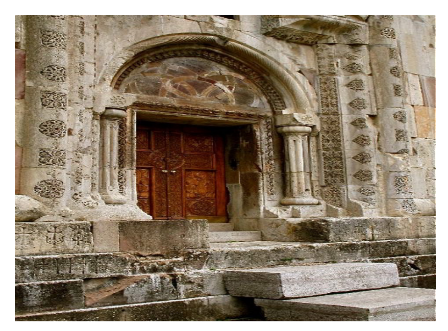
Remnants of the damage to Gandzasar's exterior, from Azerbaijani aerial bombardment in the Nagorno-Karabakh War in the 1990s, are still visible to this day (2010).

And, unfortunately, there is no formal mechanism in international law that can protect these sites from Azerbaijan's intentional destruction.