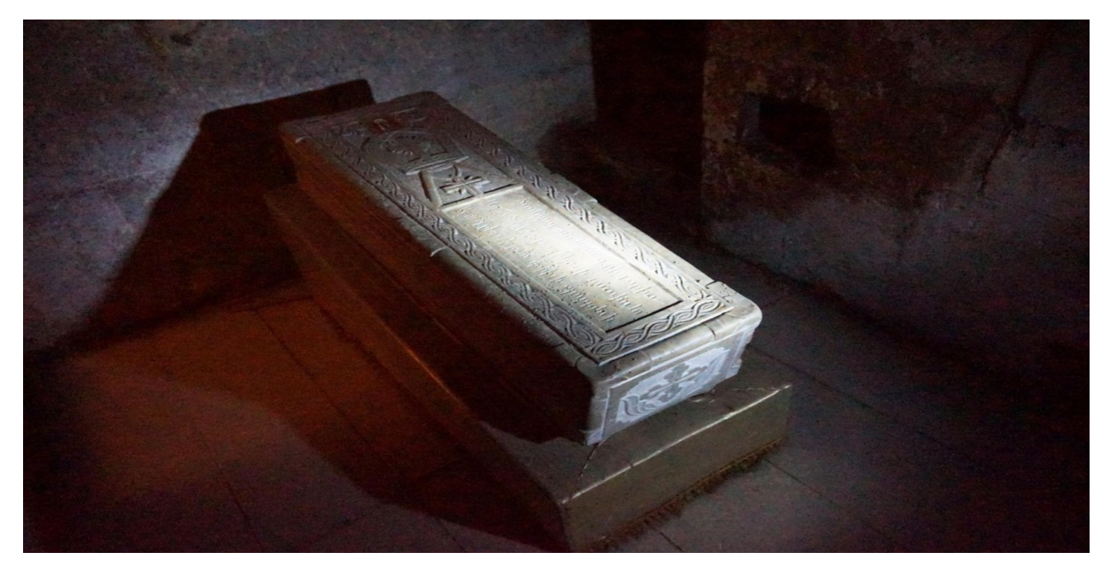
In addition to being the first Armenian language school in the 5th century, Amaras Monastery contains the burial tomb of St. Grigoris, the grandson of St. Gregory the Illuminator, and the Catholicos of New Albania. Amaras was plundered in the 13th century by the Mongols, desecrated in 1387 by the campaigns of the "Sword of Islam" Tamerlane, and demolished once again in the 16th century only to be rebuilt in the 17th with fortified walls, then later abandoned, then used by Russian Imperial troops as a frontier fortress, then rebuilt and its church reconsecrated in 1858 with funds from the Armenians of the city of Shushi. This photograph was taken in 2015.