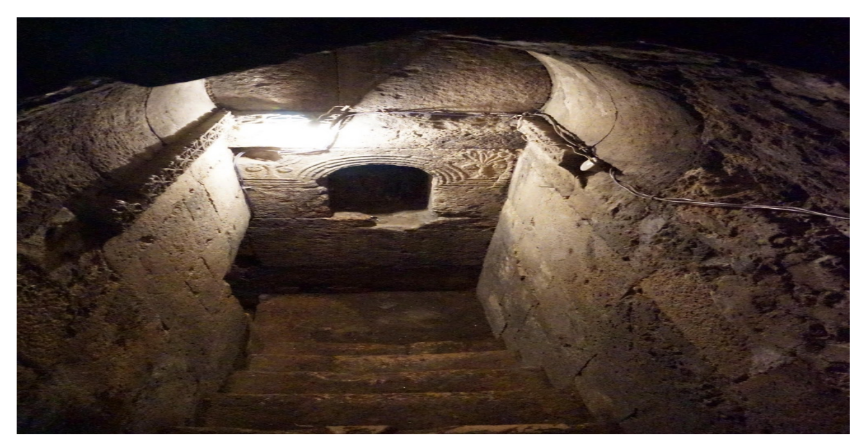
A different view of Amaras's crypt, 2015

In contrast to the largely homogenous Armenian self-identity, Azerbaijani identity developed more recently and looks externally. The first references to this Turkic-speaking population as "Azerbaijani" and "Azeri" appeared in the early 20th century, upon the formation of the short-lived Azerbaijan Democratic Republic in 1918. Prior to that, the population was referred to as the "Caucasian